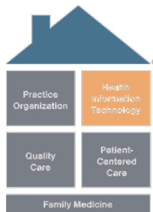
Exhibit 5: Care Coordination and Health IT 2

In order to implement these innovative approaches, practice staff must embrace change. The following key change management actions can be applied to implementing the PCMH model of care.