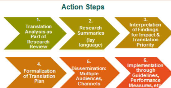
Figure 1 Translation: Systematically Moving Knowledge into Action

Constellations Major initiatives addressing big health system challenges by leveraging the Optum Labs assets of big data, diverse partnerships and end to end design from discovery to care improvement