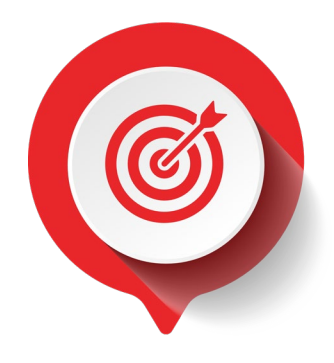
Ideas for potential HITAC activities to address the identified gaps