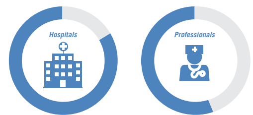
Figure 3. U.S. Hospitals' Capability to Electronically Query Patient Health Information from Outside Their Organization or System 2013