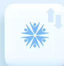
Other public health agencies